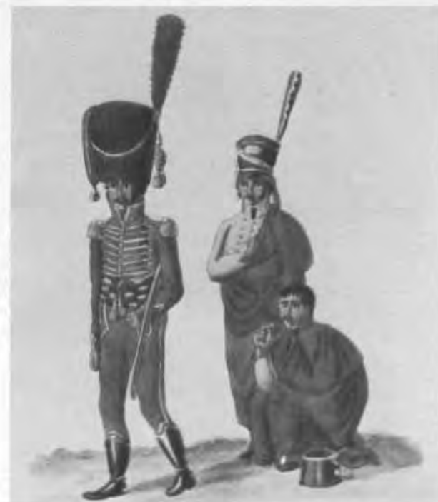
Officer and carabinieri of the Villa Viciosa Light Dragoons: After becoming a light dragoon regiment the Villa Viciosa Regiment received the hussar-type uniform shown here; green with red facings, bag and plume to busby; elite company – white buttons, lace and epaulettes. The officer's sabre scabbard is brass, his sash green with red and white striped knots. The two Carabinieri are from 'normal' squadrons and thus wear shakos; in barrack dress, as here, they wear their yellow waistcoats with facings shown only on the cuffs. The shako plume is in a black oilskin cover and the red cockade is at the front bottom band of the shako. The greatcoats are green

Foot Artillery: Bicorns with yellow (gold) edging, yellow loop and button, red cockade. Dark blue coat, dark blue lapels edged red, red collar with yellow (gold) grenade badge, red cuffs, dark blue, three pointed cuff flaps with three buttons, red turnbacks with yellow (gold) fleur-de-lis badges, red edged, vertical pocket flaps. Officers