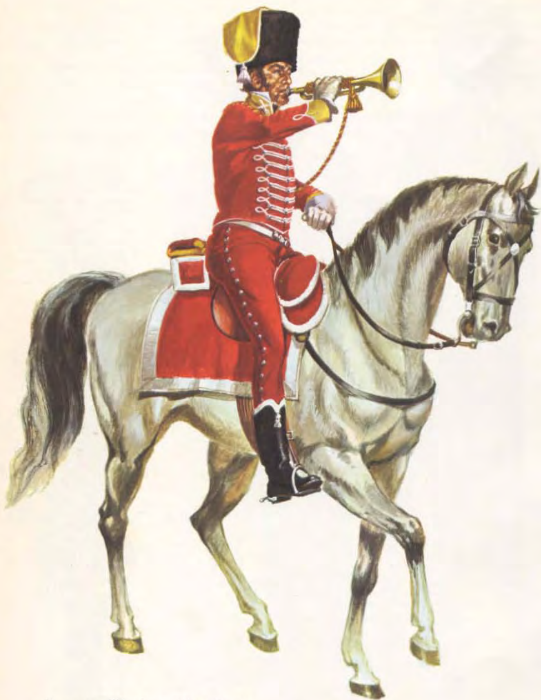
Trumpeter of Cazadores of the regiment Olivenza, élite company (carbineros), 1806