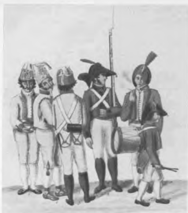
Musketeers (Figures 2 & 4) of the infantry Regimiento de la Princesa, de Guadalaxara (Figures 3 & 5) and de Asturias (Figure 1): Here is a discrepancy between the Berlin copy of Suhr's work and the Hamburg copy. The title shown above is taken from the Hamburg copy, the Berlin title reads: 'Musketeers (Figure 1) from Asturias; (Figures 2, 4 & 5) from Princesa and (Figure 3) from Guadalaxara.' The figures are coloured as follows: Figure 1 (on the left): facings light green, buttons white, sash red. Figure 2 (2nd from the left): hat band light blue, top piping red; collar black, sleeve lacing red, pocket patch black edged red, trouser decorations light green, sandals light brown with light green laces. Figure 3 (3rd from left): hat band and piping red, facings red, buttons white. Figure 4 (4th from left): dark blue coat, black facings, red piping, plume and sash, yellow buttons and collar badge. Figure 5 (and presumably the drummer) (on the right): blue coat, red plume and facings, red sash and piping (drummer with red and white lace, yellow collar badge and buttons; brass drum with black hoops)

'When this was the state of the Spanish armies, it is no wonder that the British observer, whether officer or soldier, could never get over his prejudice against them. It was not merely because a Spanish army was generally in rags and on the verge of starvation that he despised it. These were accidents of war which every one had experienced in his own person: a British battalion was often tattered and hungry. The Spanish government was notoriously poor, its old regiments had been refilled again and again with raw conscripts, its new levies had never had a fair start. Hence came the things which disgusted the average Peninsular diarist of British origin – the shambling indiscipline, the voluntary dirt, the unmilitary habits of the Spanish troops. He could not get over his dislike for men who kept their arms in a filthy, rusty condition, who travelled not in orderly column of route but like a flock of sheep straggling along a high road, who obeyed their officers only when they pleased. And for the officers themselves the English observer had an even greater contempt: continually we come across observations to the effect that the faults