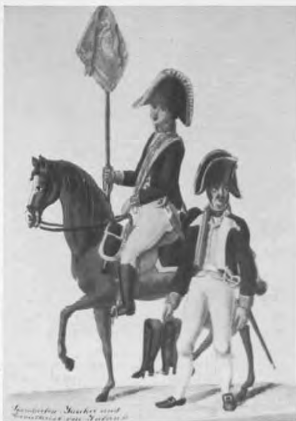
Cornet and trooper Cavalry Regimiento Infante: It might seem that the brothers Suhr have slipped up on this one; of the three Spanish cavalry regiments in Romana's division (Del Rey, Infante and Algarbe) only Del Rey had red facings and yellow buttons as shown on this plate. Hat trim, waistcoat and breeches are yellow. The standard is red with gold embroidery and fringe, red cravat, black lance with gold tip. The trooper does have white lapels but his collar and cuffs are red. In his hand he carries what seem to be black leather gaiters with steel spurs attached.

‘It is when we turn to the cavalry that we come to the weakest part of the Spanish army. There were twelve regiments of heavy and twelve of light horse, each with a nominal establishment of 700 sabres, which should have given 16,800 men for the whole force. There were only about 15,000 officers and troopers embodied, but this was a small defect. A more real weakness lay in the fact that there were only 9,000 horses for the 15,000 men. It is difficult for even a wealthy government, like our own, to keep its cavalry properly horsed, and that of Charles IV was naturally unable to cope with this tiresome military problem. The chargers were not only too few, but generally of bad quality, especially those of the heavy cavalry: of those which were to be found in the regimental stables a very large proportion were not fit for service. When the five regiments which Napoleon demanded for the expedition to Denmark had been provided with 540 horses each and sent off, the mounts of the rest of the army were in such a deplorable state that some corps had not the power to horse one-third of their troopers: e.g. in June, 1808, the Queen’s Regiment, No 2 of the heavy cavalry, had 202 horses for 668 men; the 12th Regiment had 259 horses for 667 men; the 1st Chasseurs – more extraordinary still – only