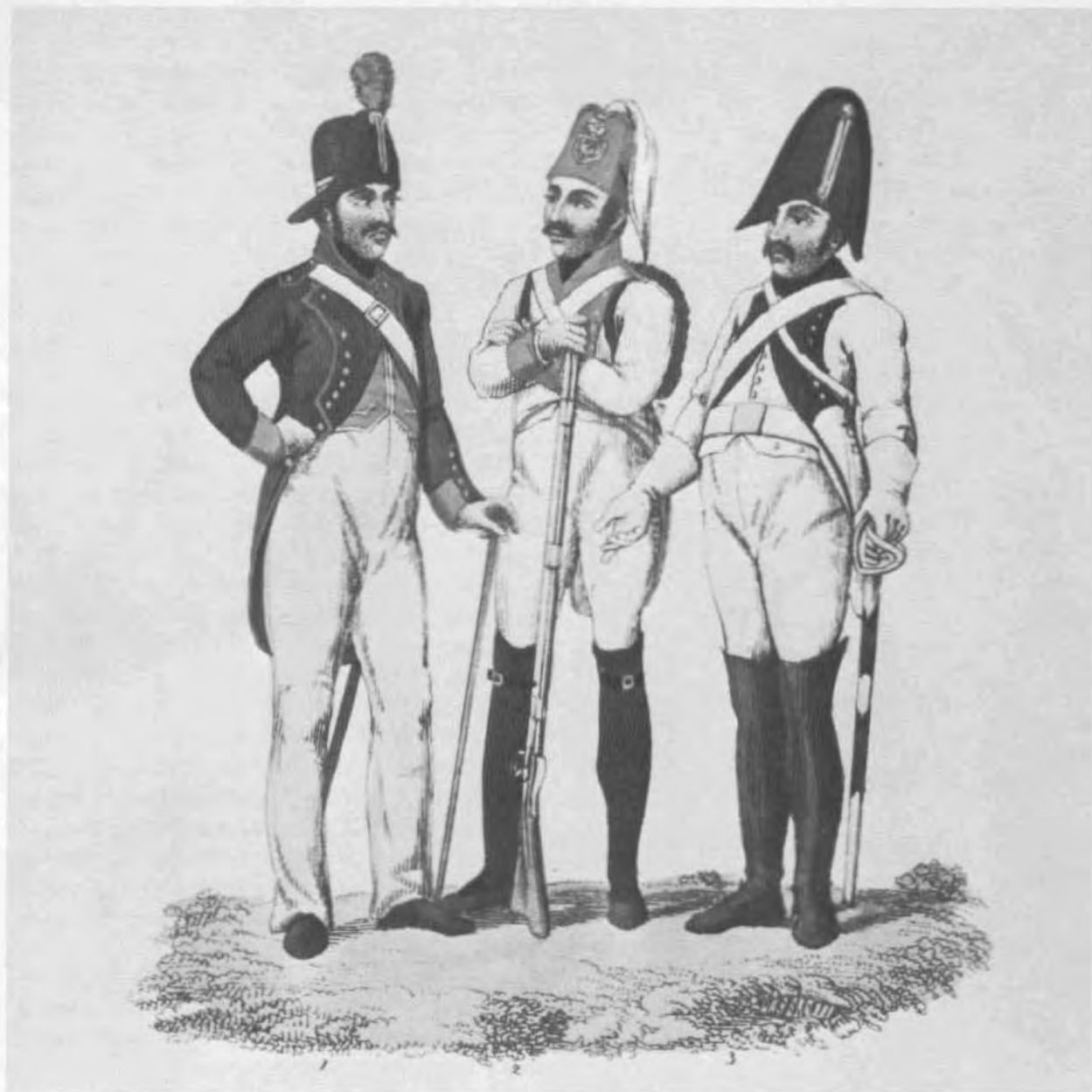
Spanish Army: (1) Canonier, Royal Artillery. (2) Fusilier of the 1st Regimento de Estramadura. (3) Dragoon of the Regimento de Zamora (from Goddard and Booth): The artilleryman looks quite authentic and the fusilier is wearing his fatigue cap in the facing colour (crimson) and white with a regimental badge on the front. Normal headwear would have been the bicorne. The long black gaiters were worn in summer and in winter. The Dragoon is impossible to place; there was no regiment of dragoons entitled de Zamora but the yellow coat and the equipment certainly indicate a dragoon regiment. The black facings lead us to the regiment 'de Numancia' but the collar badge (crossed sabre and palm) is missing (National Army Museum)

1807, intern all Englishmen then in Portugal and confiscate all English goods. João refused (the British fleet would have destroyed Lisbon and taken Brazil if he had not!) and the pre-planned Franco-Spanish invasion of Portugal was set in motion.