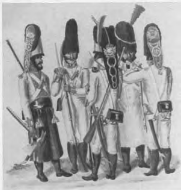
Grenadiers and pioneers of the Regiments de Zamora and de Guadalajara: Once again the titles in the Hamburg and in the Berlin copies of Suhr's work differ.

Berlin reads (from left to right): pioneer, Guadalajara (5); grenadier Zamora (1); pioneer Zamora (3); grenadier Zamora (4); grenadier Zamora (2). Hamburg reads: (1 & 2) grenadiers Zamora; (3) pioneer, Zamora; (4) grenadier, Zamora; (5) pioneer, Guadalajara. As can be seen, the Hamburg figures shown here are not numbered. The colours (left to right): (a.) Facings and bonnet flame red, buttons and decoration to flame, white with a light blue circular patch at the top. Cap plate, brass; match case brass; apron black with red and white tassels, red epaulettes. (b.) Facings black (very faint), buttons white, bonnet flame red. (c.) Facings, epaulettes and cap flame black; white lace to bonnet, flame. Circular patch light blue with arm holding the Spanish flag. Cap plate, pouch badge and sabre fittings brass. Plume red. (d.) Plume red, buttons white. (e.) Facings pale grey (faded paint?) bonnet flame red with yellow lace; grenade on pouch lid and sabre fittings brass