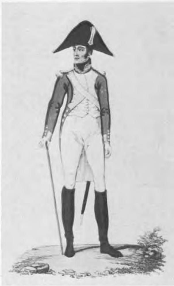
Spanish officer of infantry of the line, Regimiento de Irlanda: Having given collar badges (correctly) to the artillery and heavy cavalry, Goddard now donates them to this foreign regiment, a supposition not confirmed in the 'Coleccion de Noventa' of 1806 (National Army Museum)

On 9 July 1808 King Joseph left Bayonne with 1,500 French troops to enter Madrid and take up his new throne. The whole of Spain was united in a common cause – to throw this French usurper out of the country. The remnants of the Spanish army (about 35,000 strong) concentrated near Benavente under General Cuesta but were scattered on 14 July 1808 at the battle of Medina del Rioseco by Marshal Bessi res, commander of Old Castile and Leon, with half that number of French troops. On 20 July Joseph entered Madrid with a much reduced following but this