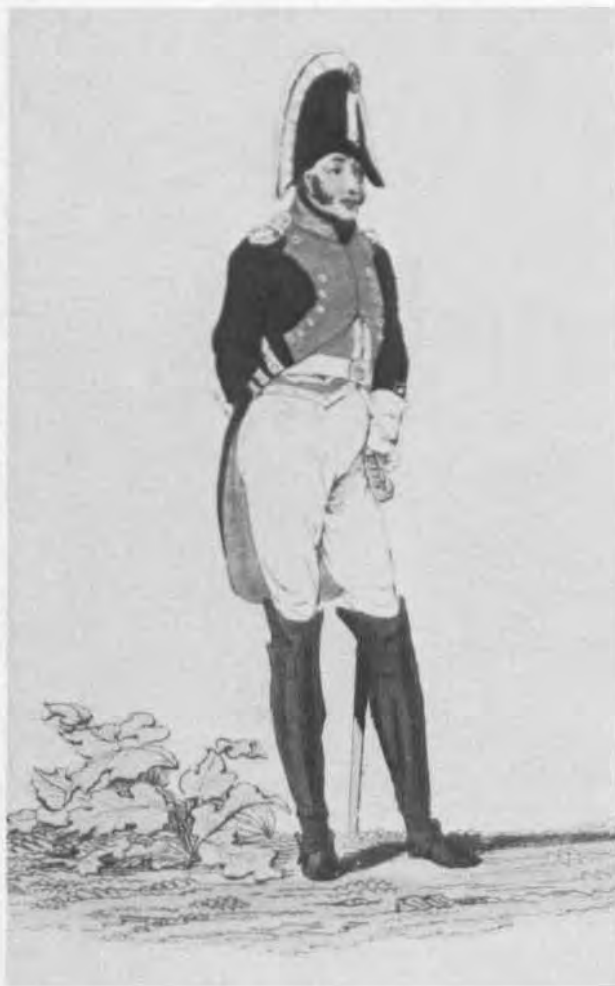
Spanish officer of heavy horse, Regimiento Carabineros de la Reyna: Once again, the squiggle collar badge spoils this otherwise excellent plate from Goddard and Booth. The badge should have been a rampant lion. The cuffs are also suspect; the Spanish heavy cavalry wore plain round cuffs at this time without cuff flaps

to provide a further 17,000 men to garrison Portugal after the end of the conquest. Portugal was to be split into three parts. One of these (the northern area between the rivers Duero and Minho) was to become the 'Kingdom of North Lusitania' and was to be given to the Queen of Etruria as compensation for the loss of Tuscany. The southern provinces of Alemtejo and the Algarve were to go to Godoy, while the central area was to remain under French administration until 'peace reigned in Europe'. The Portuguese colonies were to be divided between France and Spain and Charles IV was to receive the title 'Emperor of America'.