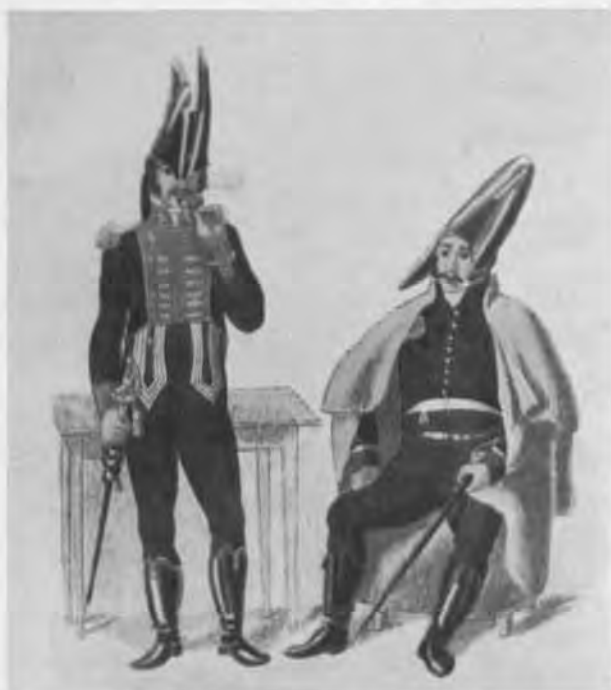
An officer of the cavalry Regimiento El Rey and one of another regiment: The left hand figure is the officer from the El Rey regiment, colours as for Regiment Infante; breeches dark blue with gold decorations. Sword hilt and knot gold, sheath and slings black. Undress boots with gold trim. The seated officer is Spanish as his red cockade betrays but his silver buttons and cuff lace and gold epaulettes do not indicate his regiment. His coat and trousers are dark blue, greatcoat light brown

and in raising many new ones. But the gain in number was not in the least accompanied by a gain in efficiency. For the whole six years of the struggle the mounted arm was the weakest point of their hosts. Again and again it disgraced itself by allowing itself to be beaten by half its own numbers, or by absconding early in the fight and abandoning its infantry. It acquired, and merited, a detestable reputation, and it is hard to find half a dozen engagements in which it behaved even reasonably well. 4 When Wellington was made generalissimo of the Spanish armies in 1813 he would not bring it up to the front at all, and though he took 40,000 Spaniards over the Pyrenees, there was not a horseman among them. . . .