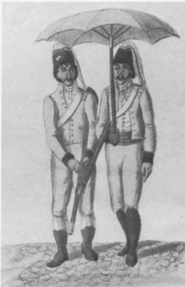
Grenadiers of the infantry Regimiento de Zamora going to muster parade: It seems that the Hamburg climate was as good as that in England in the years 1808-9! Both men are in fatigue dress, facings black, sash red