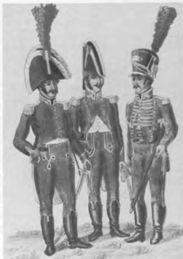
Officers from the light dragoon Regimiento Villa Viciosa: Here three forms of dress are clearly shown; on the left is the surtout, centre the habit-veste and on the right the normal service dolman. On all three the colours are the same, green coat and breeches, red facings and piping, white buttons, lace, epaulettes and edging to collar and cuffs. Plumes are red, the two left hand figures have brass sabre scabbards (the centre figure has red and gold slings) the right hand figure has a light brown, straight, sword sheath and his sash is green with red and white striped knots, green tassels

‘In 1808 there was but one small military college for the training of infantry and cavalry officers. Five existed in 1790, but Godoy cut them down to one at Zamora, and only allowed sixty cadets there at a time, so that five-sixths of the young men who got commissions went straight to their battalions, there to pick up (if they chose) the rudiments of their military education. From want of some common teaching the drill and organization of the regiments were in a condition of chaos. Every colonel did what he chose in the way of