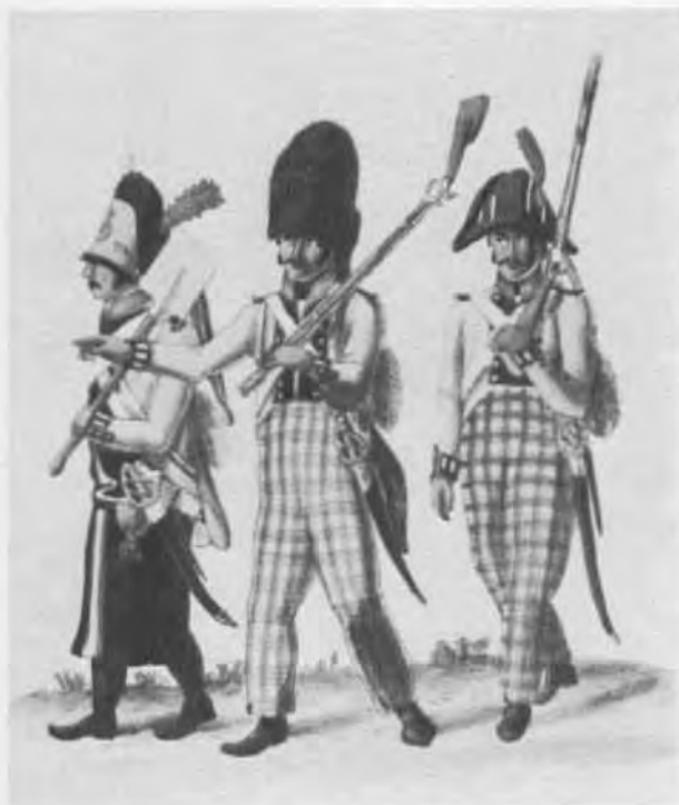
Grenadiers and a pioneer from the infantry Regimiento de Zamora: Theoretically Zamora should have had white collars, Suhr shows them brown. The pioneer has a black fur bearskin cap with yellow plate, red plume and black 'tail' with white piping. His grenadier 'epaulettes' have scalloped edges instead of fringes. Facings are black as is the apron (yellow pockets with yellow and black fringes) and the sabre and bayonet sheath. The grenadier (centre) has a black bearskin, jacket as for the pioneer and under his goatskin pack he has hung his bicorne with red cockade. Trousers of blue and white cloth. The right hand figure is as for the centre figure except that the bicorne has a red plume and white lacing