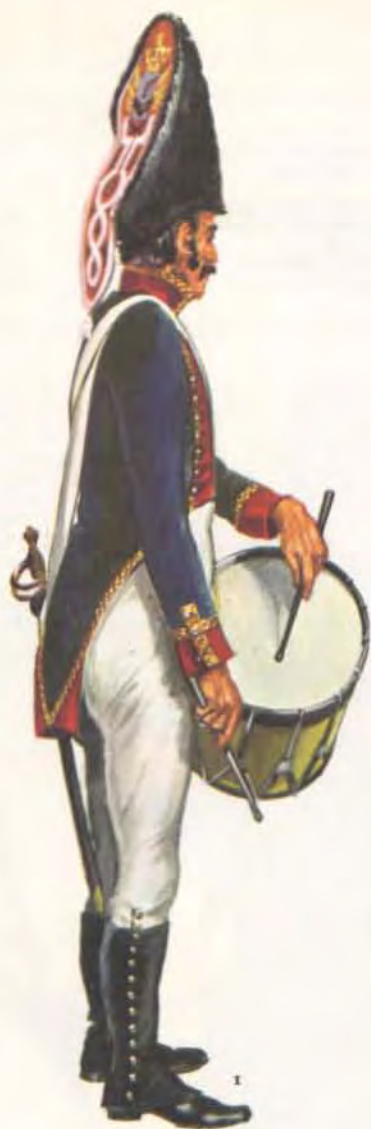
1 Drummer of grenadiers, infantry regiment Zamora