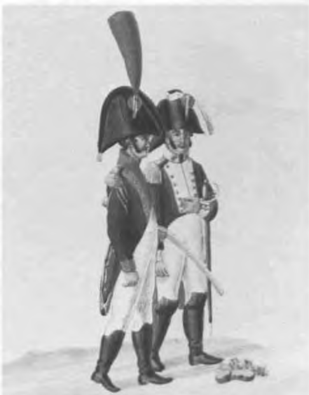
An adjutant and an officer of the Cavalry Regimiento de Algarbe: The adjutant, on the left, may not belong to the Algarbe regiment; his uniform has very little in common with that of the figure on the right which coincides completely with the description in the 'Collecion de Noventa . . .'. The Adjutant has a dark blue coat with red facings and gold buttons and epaulettes; the turnbacks are piped white as are the pockets; the sabre sheath is brass, the plume red. The Algarbe officer has a dark blue coat, yellow facings and breeches, white buttons and hat trim, gold epaulette and lion collar badge, brown sword sheath