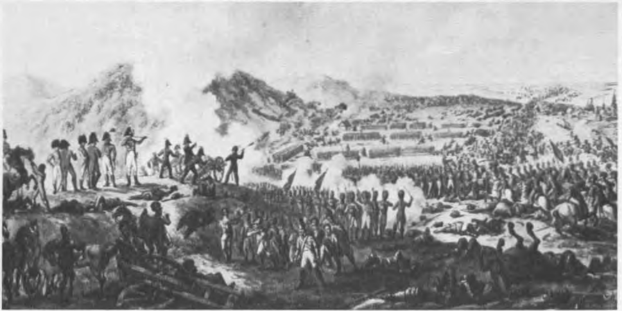
The battle of Talavera de la Reyna, 28 July 1809: In the foreground is part of the Spanish army; the artillery and light infantry are at the left, a grenadier formation in the centre. The much maligned Spanish cavalry are shown gallantly attempting a charge on the right

achievement was counterbalanced by the loss of Cordoba in Andalusia where a revolt had broken out and General Dupont had been forced to withdraw. On 21 July Dupont's 17,000-strong French force was cornered by the Spaniards under the Generals Castaños and Reding and forced to capitulate at Baylen (Napoleon had Dupont cashiered for this). News of this French defeat (the first of any size in Napoleon's reign) caused Joseph to lose his nerve and flee Madrid on 29 July. The French forces in Spain (50,000 men under Marshals Bessi eres, Ney and Moncey) withdrew to the river Ebro, and the bloody and bitter guerrilla war which was to split Spain until 1813 had begun.