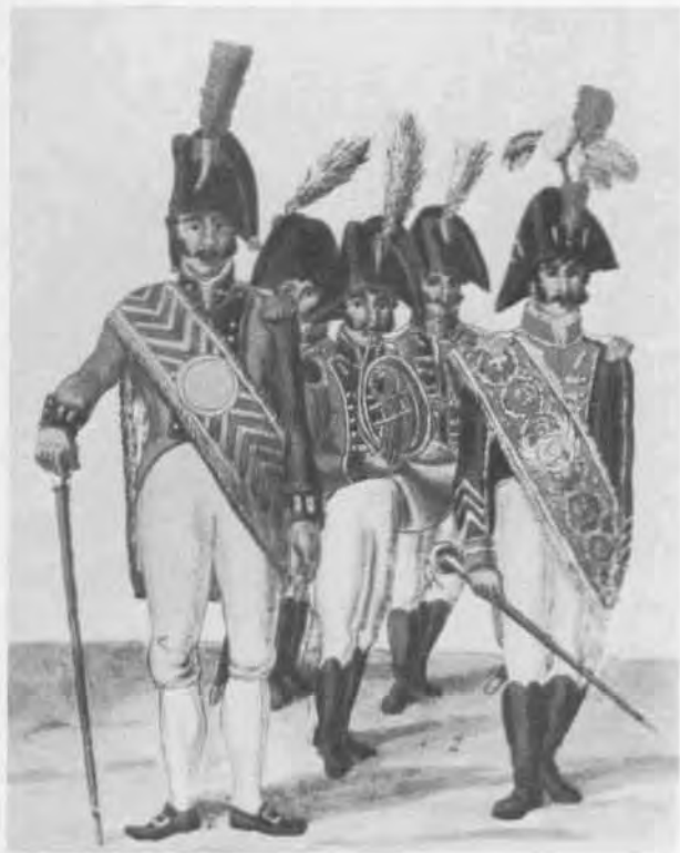
Left, drum major of the infantry Regimiento de la Princesa in the old uniform; right, musicians and drum major of the infantry Regimiento de Zamora: (Left) Light blue coat, black facings, red piping, white buttons, yellow collar badges, red and gold sash, brown staff, silver knob, red plume. The three central musicians have red coats with black facings, and white plumes, buttons and lace. The Zamora Drum Major on the right has a black coat with red facings, white buttons and epaulettes; red and white edging on facings; red, white and yellow plumes; a red and silver sash, and a brown staff with silver knob

'It is more just to admire the constancy with which a nation so handicapped persisted in the hopeless struggle, than to condemn it for the incapacity of its generals, the ignorance of its officers, the unsteadiness of its raw levies. If Spain had been a first-rate military power, there would have been comparatively little merit in the six years' struggle which she waged against Bonaparte. When we consider her weakness and her disorganization, we find ourselves more inclined to wonder at her persistence than to sneer at her mishaps.'