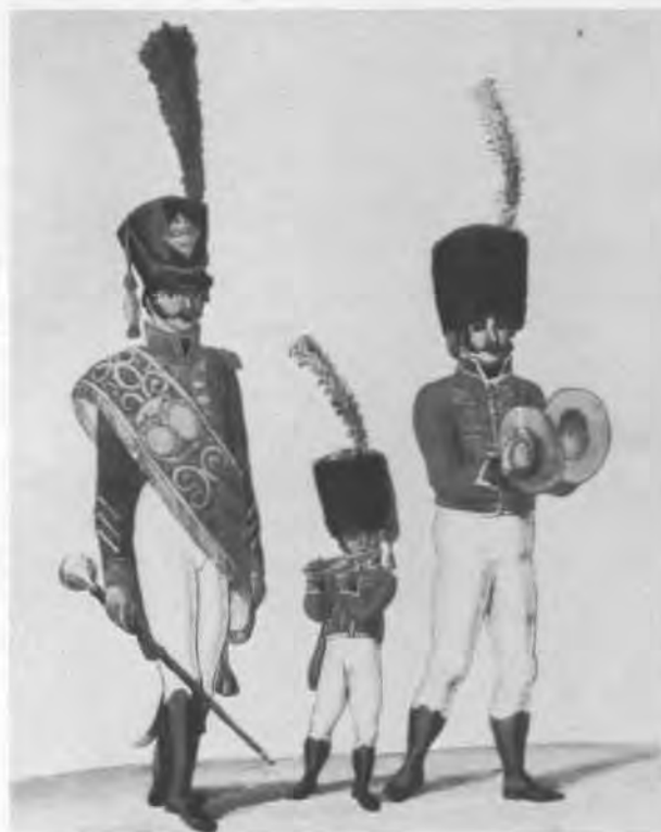
Drum major of the Regimiento de Cataluna Light Infantry and two musicians from the Regimiento de la Princesa: All figures on this plate wear the new uniforms. The drum major has a light blue (could be green) plume, yellow shako plate and cords, red facings, epaulettes and sash with gold embroidery. The 'babe' in the centre and the right hand figure wear light blue plumes, red busby bags, black fur, white trim; red dolman dark blue facings, white lace and buttons

'It is well worth while to look at the details of its composition. The infantry consisted of three sorts of troops – the Royal Guard, the line regiments, and the foreign corps in Spanish pay. For Spain, more than any other European state, had kept up the old seventeenth-century fashion of hiring foreign mercenaries on a large scale. Even in the Royal Guard half the infantry were composed of "Walloon Guards", a survival from the day when the Netherlands had been part of the broad dominions of the Habsburg kings. The men of these three battalions were no longer mainly Walloons, for Belgium had been a group of French departments for the last thirteen