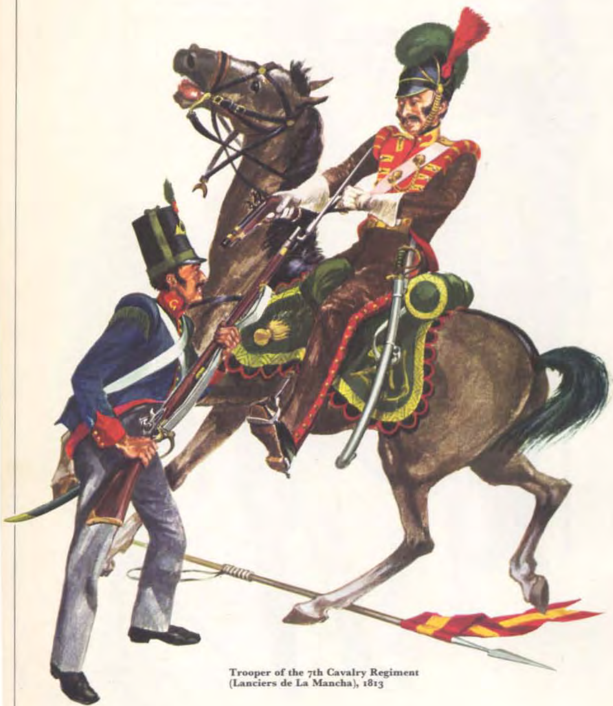
Trooper of the 7th Cavalry Regiment (Lanciers de La Mancha), 1813