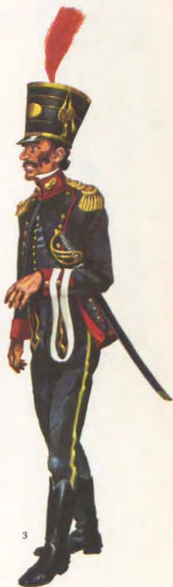
3 Officer, infantry regiment Princessa